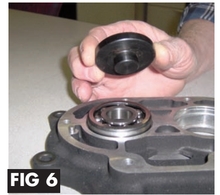
Performance Parts For Harley-Davidson Motorcycles